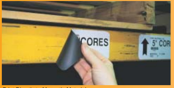
Print Directly to Magnetic Material